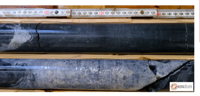
Angus Vein Discovery